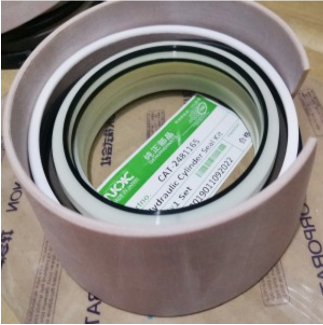
Replacement OEM Seals