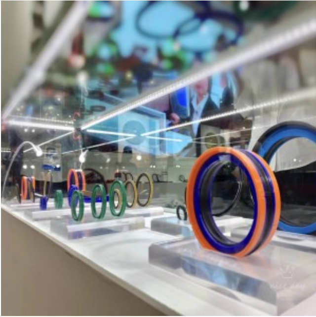
High Quality Seals